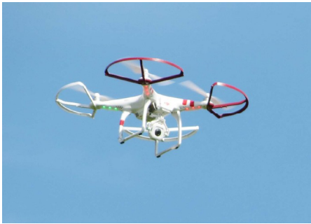
A phantom hovered above taking in all the action.