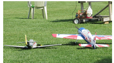
Phil Schumacher's planes sit in the pits.