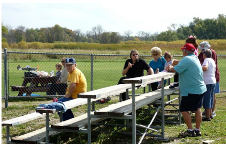
The crowd looks on.