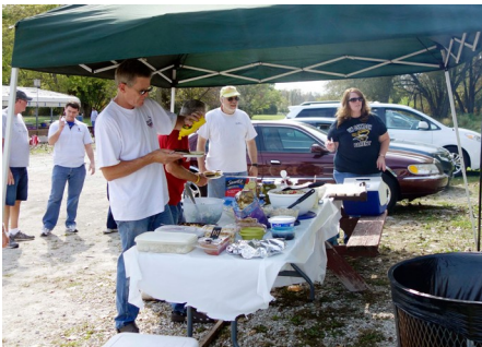
Lunch line forming